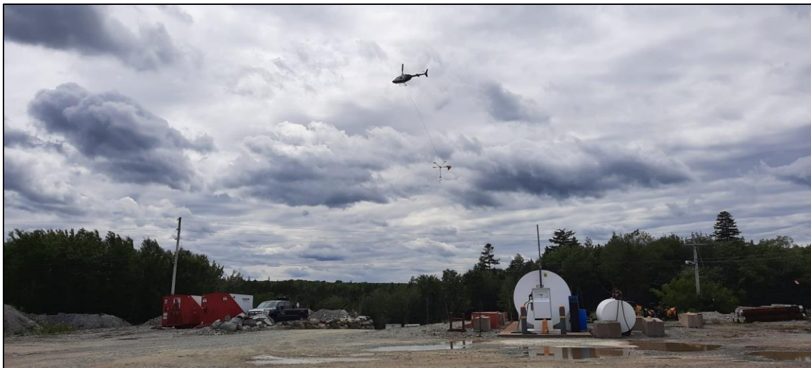
Figure 2. Photograph of helicopter conducting HeliGT survey at Aureus East and West project.

“We are really excited to have carried out these important studies; the results will provide us with critical data to support our drilling strategy. Our properties are under-explored and offer great opportunities to find more gold. There are strong indications of multiple gold trends adjacent to our known gold zones, especially at Aureus East and West. The airborne survey allows us to quickly identify potential new trends and provide our team with prioritized corridors to carry out focused ground exploration. In addition, the Televue survey provides a new level of detail that will substantially refine our interpretation of the geology hosting our gold,” commented Jeremy Niemi, VP Exploration.