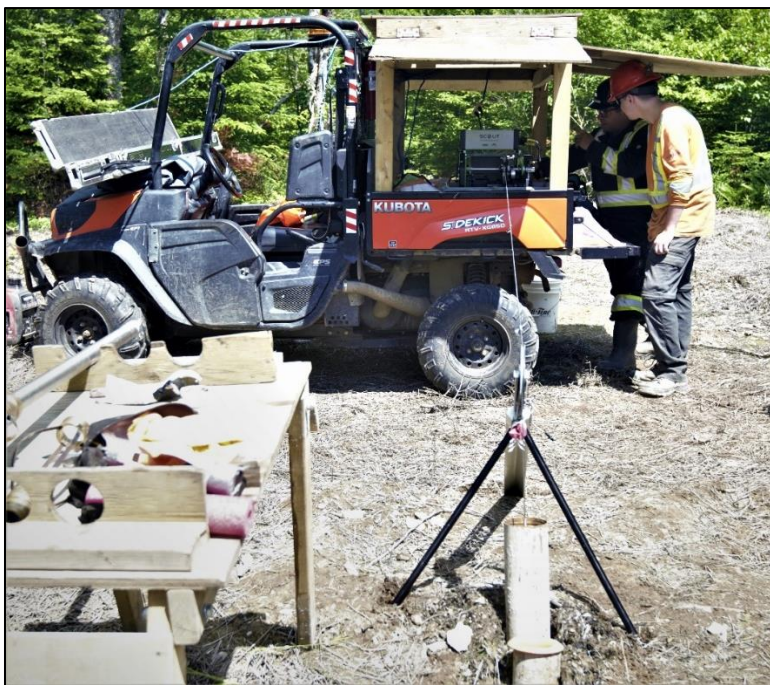
Figure 3. Photograph of contractor conducting high precision borehole Optical Televiewer program survey at Aureus West project.

The borehole Optical Televiewer program is designed to significantly enhance the geological interpretation of the host rocks and the gold veins of the Aureus East and West properties. This data allows the team to define new targets, expand zones, and effectively complete important infill drilling ahead of a mineral resource work on multiple gold zones.